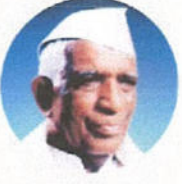
Founder President, Council of Education, Kolhapur